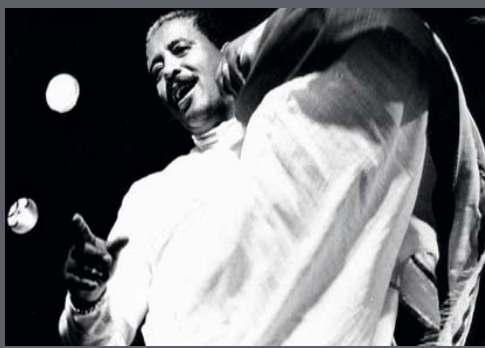
"Swinging Ethiopia" by Catherine Maximoff. Produced by Les Films du Présent, with the support of Provence-Alpes-Côte d'Azur Film Fund (France).