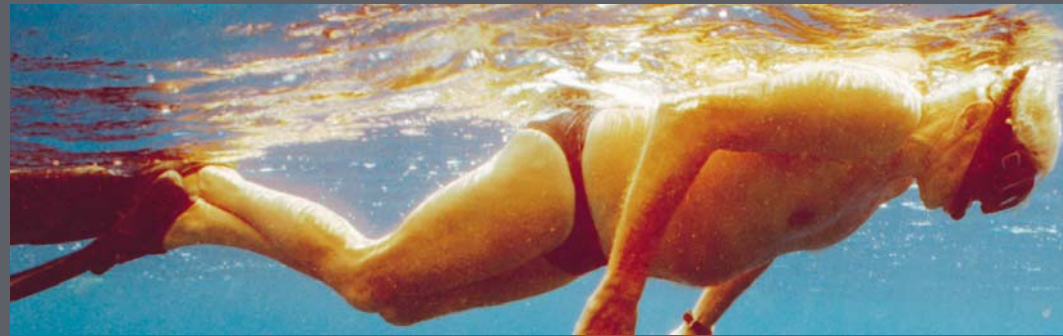
"One deep breath" by Anders Gustafsson. Produced by Auto Images, with the support of Film I Skåne (Sweden). Copyright?