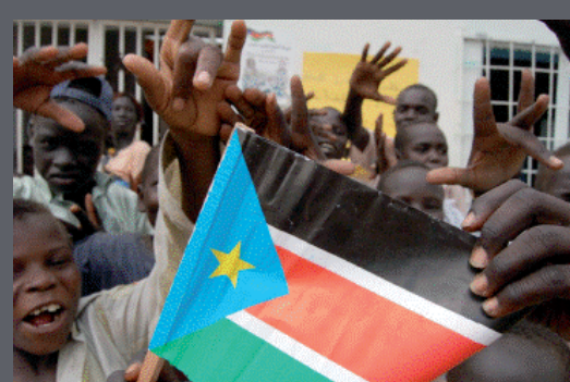
"After the weapons, the birth of a nation" by Florence Miettaux, produced by Les Films du Zèbre with the support of Rhône-Alpes region.