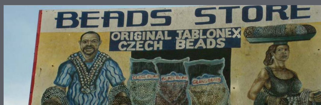
"Queens of Glass Beads" by Corinne Kuenzly, produced by Reck Filmproduktion with the support of Zürcher Filmstiftung.