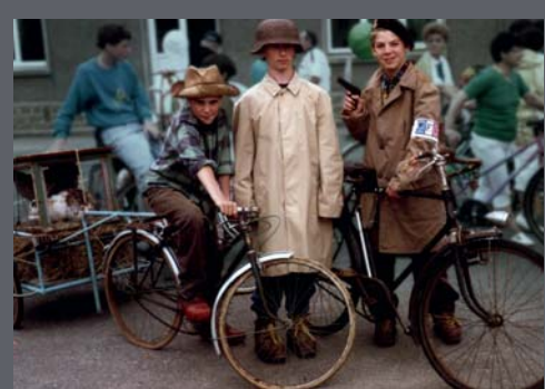
"Discovery or Ignorance" by Vincent Jaglin, produced by Chaz Productions with the support of Pôle Image Haute-Normandie.